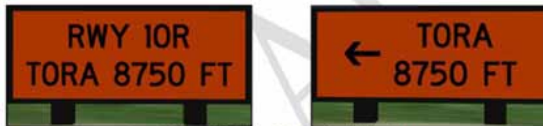
Figure 15. Take-Off Run Available Signs