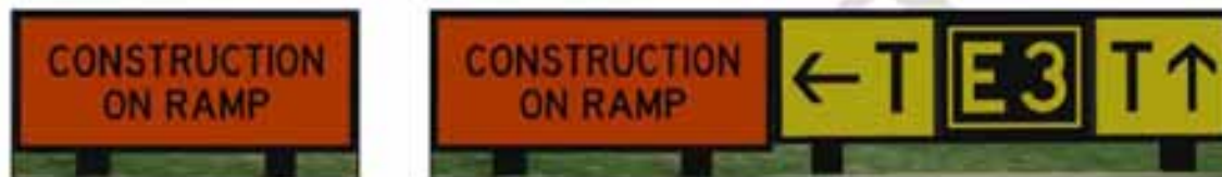
Figure 14. Construction on Ramp