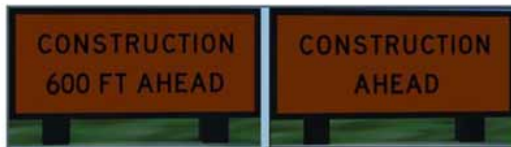
Figure 13. Construction Ahead Signs