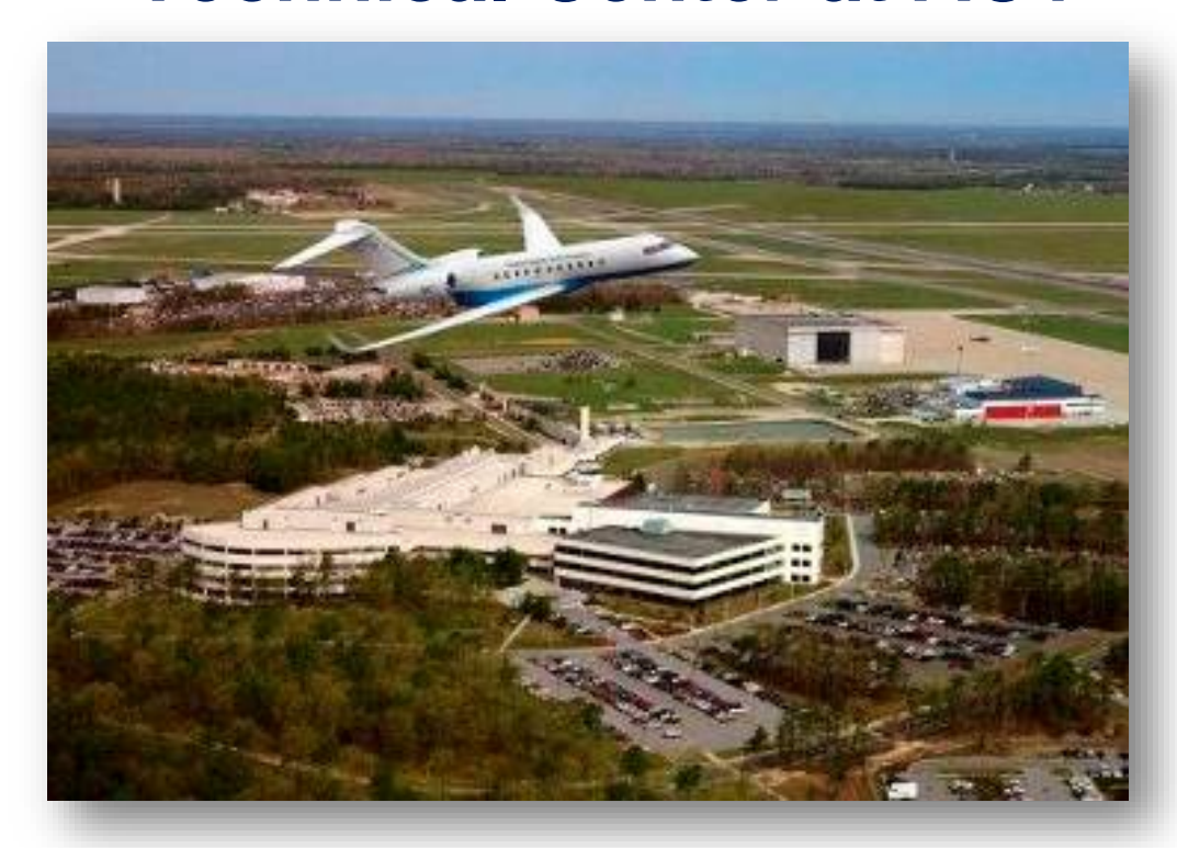
3,000 Federal/Contractor Employees 1,000 non-FAA Tenants Over 5,000 Acres